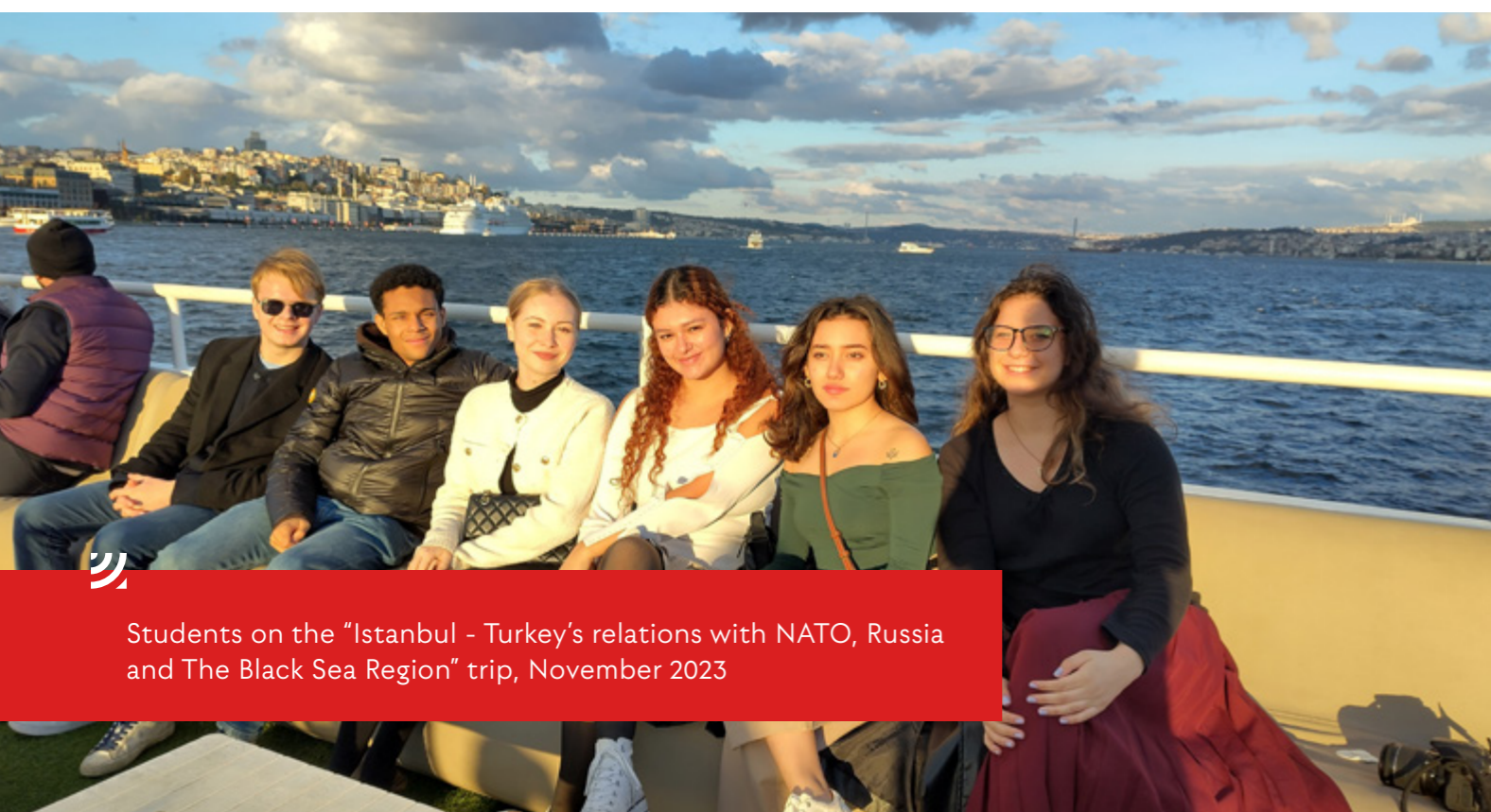
||| Students on the "Istanbul - Turkey's relations with NATO, Russia and The Black Sea Region" trip, November 2023