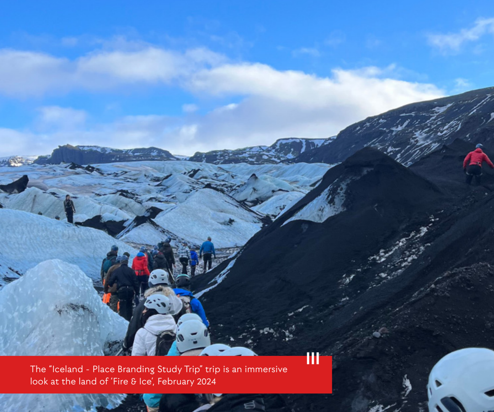
||| The "Iceland - Place Branding Study Trip" trip is an immersive look at the land of 'Fire & Ice', February 2024