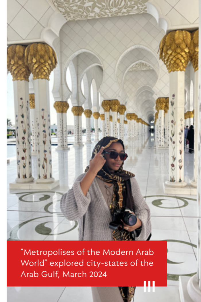
||| "Metropolises of the Modern Arab World" explored city-states of the Arab Gulf, March 2024