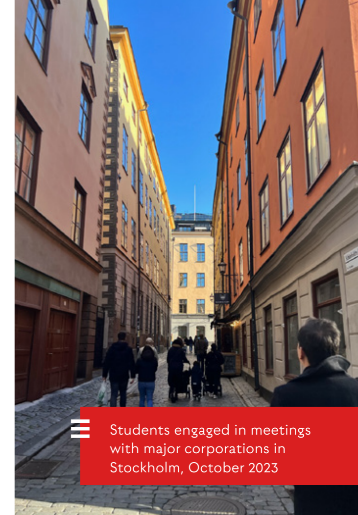
||| Students engaged in meetings with major corporations in Stockholm, October 2023