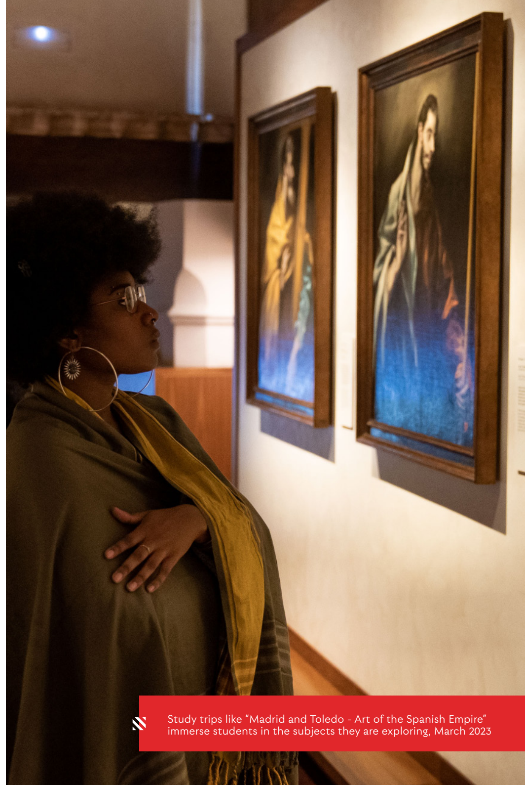
Study trips like "Madrid and Toledo - Art of the Spanish Empire" immerse students in the subjects they are exploring, March 2023