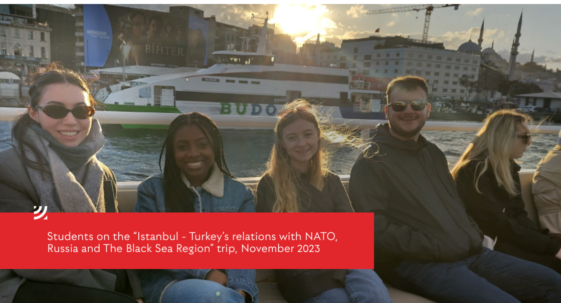
Students on the "Istanbul - Turkey's relations with NATO, Russia and The Black Sea Region" trip, November 2023